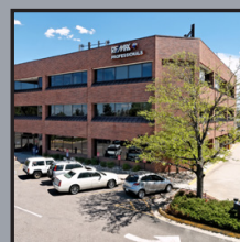
DENVER TECH CENTER