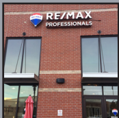
DENVER TECH CENTER